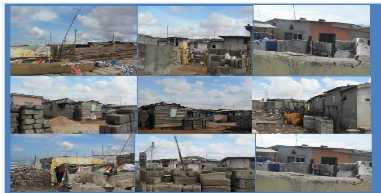
Figure1: Houses located in the study areas

The study was conducted in two slum communities, Chorkor and Korle-Gonno, which are located in the central parts of the Greater Accra Region of Ghana. The communities are homogeneous in nature because residents in both communities have relatively low education levels, high levels of unemployment and generally low incomes. These communities were selected for the study because previous studies 19,20 have reported that compared to residents in other settlements in Accra, the living conditions of slum dwellers are generally poor. Residents in these areas normally live in crowded houses without adequate access to water, sanitation and private bathrooms, which could negatively affect their health, as shown in Figure 1.