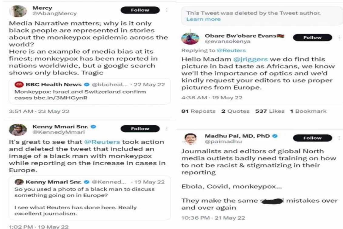
Figure 4. Screenshots of reactions on Twitter to counter the use of Black skin images by the global North media in their online reporting of the 2022 monkeypox cases in Western and European countries.