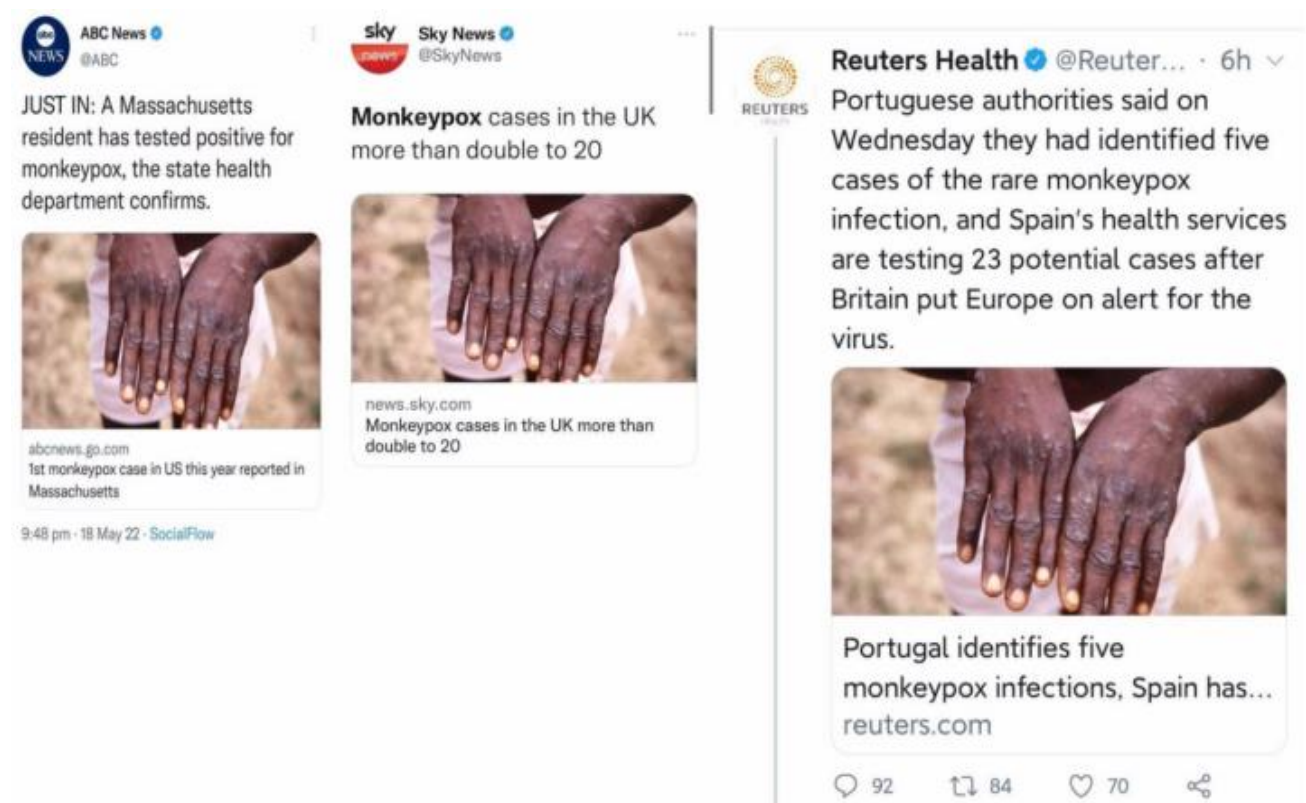
Figure 1. Screenshots of tweets from the verified Twitter accounts of ABC News, Sky News, and Reuters illustrate how foreign media use an identical image of the hands of an African with monkeypox marks to announce the outbreak of monkeypox outbreak in Western and European countries in 2022.

endemic countries, including the U.S., England, and Portugal. None of these countries were African countries, and while no cases were reported in Africa as of May 2022, the visuals used for the headline stories and the news articles by foreign media websites and their verified Twitter accounts are images of dark-skinned Africans. To report the news about the confirmed cases of monkeypox in North America and Europe, foreign media agencies like ABC News (Kekatos, 2022), Sky News, and Reuters Health all used an identical image of the hands of an African with monkeypox marks taken during an outbreak in the Democratic Republic of Congo from 1996 to 1997 (Centers for Disease Control and Prevention (CDC), 1997) to illustrate their headline news.