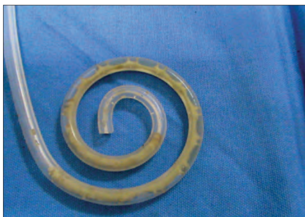
Figure 3: probable fungal mass in the lumen of a removed Tenckhoff catheter