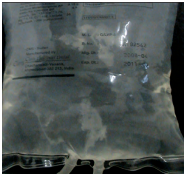
Figure 1: Fungal mass in a new unused bag