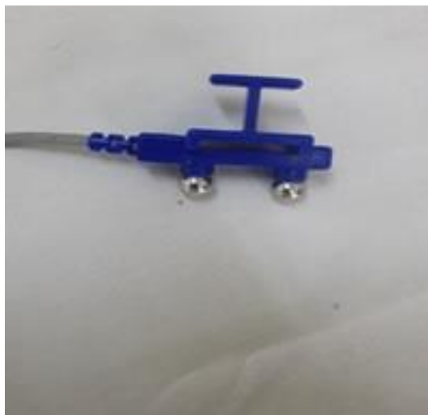
Figure 2: Bipolar electrode of stimulation