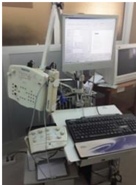
Figure 1: Electromyography device Medelec Synergy (Oxford)

All the authors do not have any possible conflicts of interest