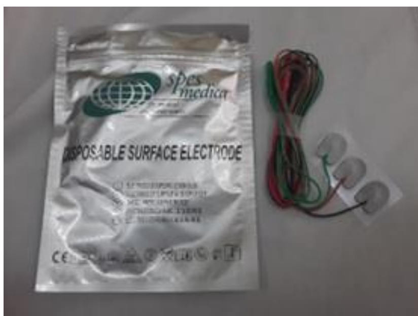
Figure 3: Self-adhesive patch electrodes