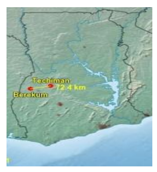
Figure 1: The location of Berekum on the map of Ghana.

The study population consisted of parents seeking healthcare for their children at the Holy Family Hospital, in Berekum. This hospital was selected purposefully for the study because it is the largest referral center in the municipality and access to eligible study participants was relatively easier.