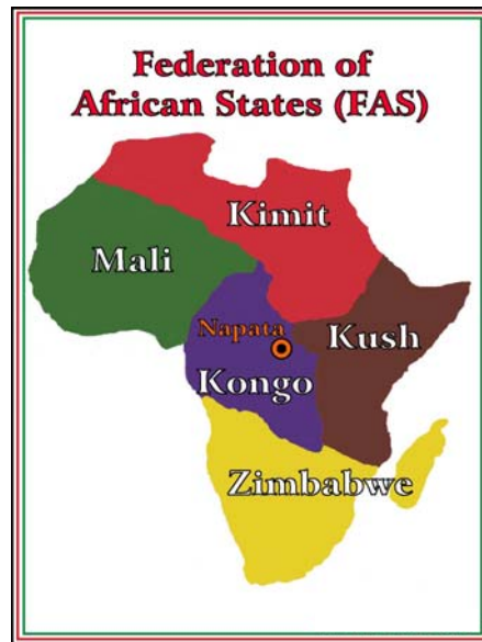
Map 1: FAS