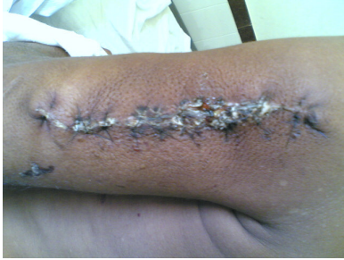
Figure 2: Skin closed primarily

Grossly, it was a soft yellowish-red, glistening on touch and well defined mass (figure-3). Histopathology confirmed the diagnosis as lipoma. Microscopic examination revealed almost mature fat cells and scattered atypical lipoblast-like cells.