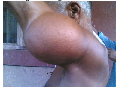
Figure 1: A huge swelling seen over the right arm

On local examination, a solitary mobile swelling of size 18 x 7 x 10 cm seen lateral aspect of the arm (Figure- 1). Overlying skin was normal. It was firm in consistency, non-tender and edges were well defined. No cervical or axillary lymphadenopathy was noted. Ultrasonography revealed a large soft tissue mass in subcutaneous area of the right arm. An elliptical incision was given longitudinally. Lump was adherent to the underlying muscles and other tissue. Surgical excision done under local anaesthesia and skin was closed primarily (Figure-2).