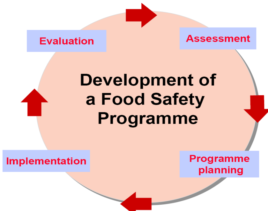
Figure 2: Process for development of a National Food Safety Programme