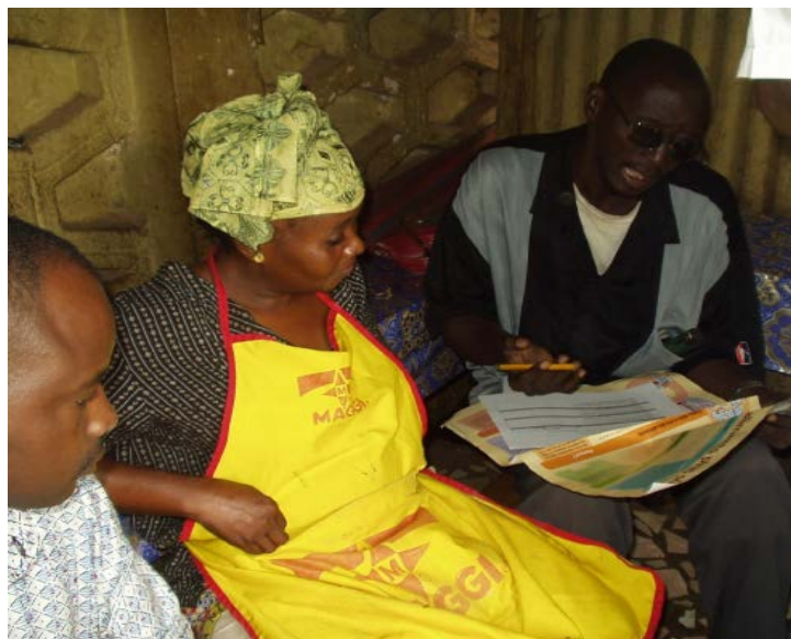
Figure 4: Educational session with a food vendor in Mali

In Mali, a food safety campaign commenced with the adaptation of the WHO five keys to safer food messages into the socio-cultural context of the country. This was done in the effort to ensure that the messages reached food handlers and the public and are translated into positive actions. The campaign included a baseline study of food safety conditions in food establishments in six districts of Bamako and training on the WHO five keys to safer food messages including educational sessions with the food handlers in the different food establishments [15].