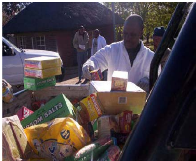
Figure 3: Inspection of food establishments in Lesotho as part of the food safety campaigns

Professional food handlers in food and catering establishments, including street food vendors, have been an important target group for training and education in food safety. In Lesotho, a food safety campaign was conducted in Maseru's Hoek district with the theme "Food Safety in All Food Establishment: A Key to Good Health" [15]. The district was among, five districts that were involved in a baseline study on food safety in 2005. The findings of the study formed the basis for planning of the food safety campaign [15]. The overall objective of the campaign was to communicate the importance of food safety to owners of food establishments, food handlers as well as street food vendors.