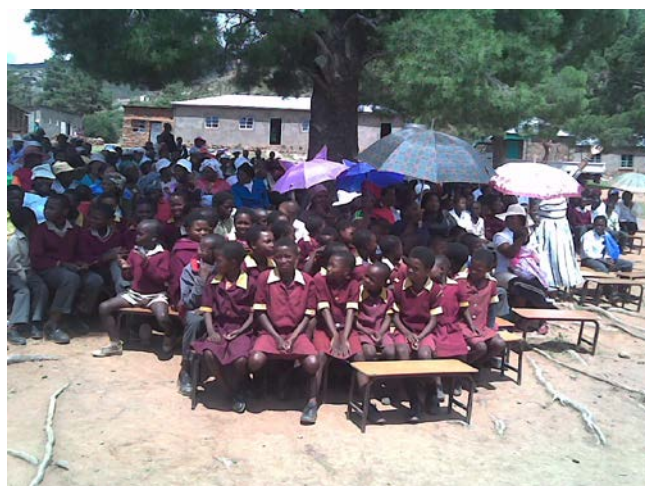
Figure 2: Award ceremony in Lesotho following food safety competitions

The school setting has been an effective setting for communicating the food hygiene principles outlined in the five keys to safer food. In addition to schoolchildren, food handlers in and/or near the schools and teachers represented an important category of personnel that were trained on the WHO five keys safer food. In Guinea, training was conducted for women street food vendors near schools in 2007 [15]. The main objectives of the activity were to sensitize and train women food vendors in school surroundings and within schools on the protection of food; equip and demonstrate to street food vendors, materials for the conservation and protection of food; and sensitize school children and teachers on proper food hygiene practices. The activity involved different actors concerned in child health and in the field of public hygiene.