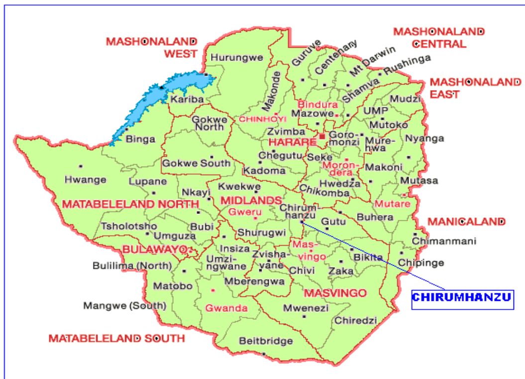
Figure 2: Map of Zimbabwe showing Chirumhanzu (Study Area)

Hama Mavhaire irrigation scheme is in Chirumhanzu District in the Midlands Province of Zimbabwe. It is 200km from Harare. This is an area of erratic rainfall between 400mm and 510mm per annum with temperatures ranging from 24 0 C to 31 0 C and is in natural farming Region IV. Soils are mainly from the granite parent material. Due to the climatic conditions in the area, crop production may not be productive and most farmers concentrate on livestock production, mainly the small ruminants. The introduction of irrigation schemes in the area has seen some crops mainly maize, groundnuts and some high value crops such as paprika and sugar beans being produced by the farmers. The main irrigation systems in the area are sprinkler and flood.