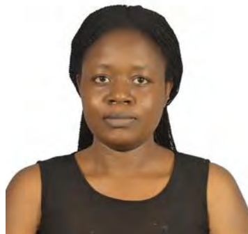
Faith Asangha Akob

Akob FA 1,2 , Pillay K 1* , Wiles N 1 and M Siwela 1