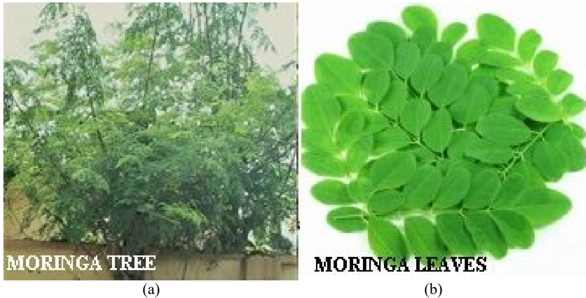
Figure 1: (a) Matured Moringa Tree (b) Moringa Leaves

acids, in addition to having thrice the potassium content of banana [7]. Also, it is high in phytochemicals and believed to be highly medicinal, as widely acclaimed and documented by various authors [1, 2, 4, 8]. These identified properties of Moringa led to its being nick-named as Miracle tree and Tree of life .