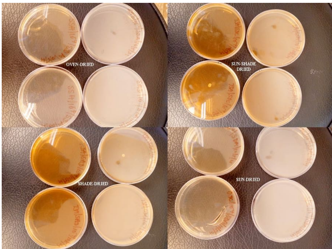
Figure 3: Microbial enumerations of Moringa leaf samples from different drying methods

The results of microbiological enumerations are presented in Figure 3 and Table 1. The Figure 3 is an image of petri-dishes of cultured samples of freshly dried leaves from different drying methods. It can be seen that all the cultures were microbiologically sterile. This indicates