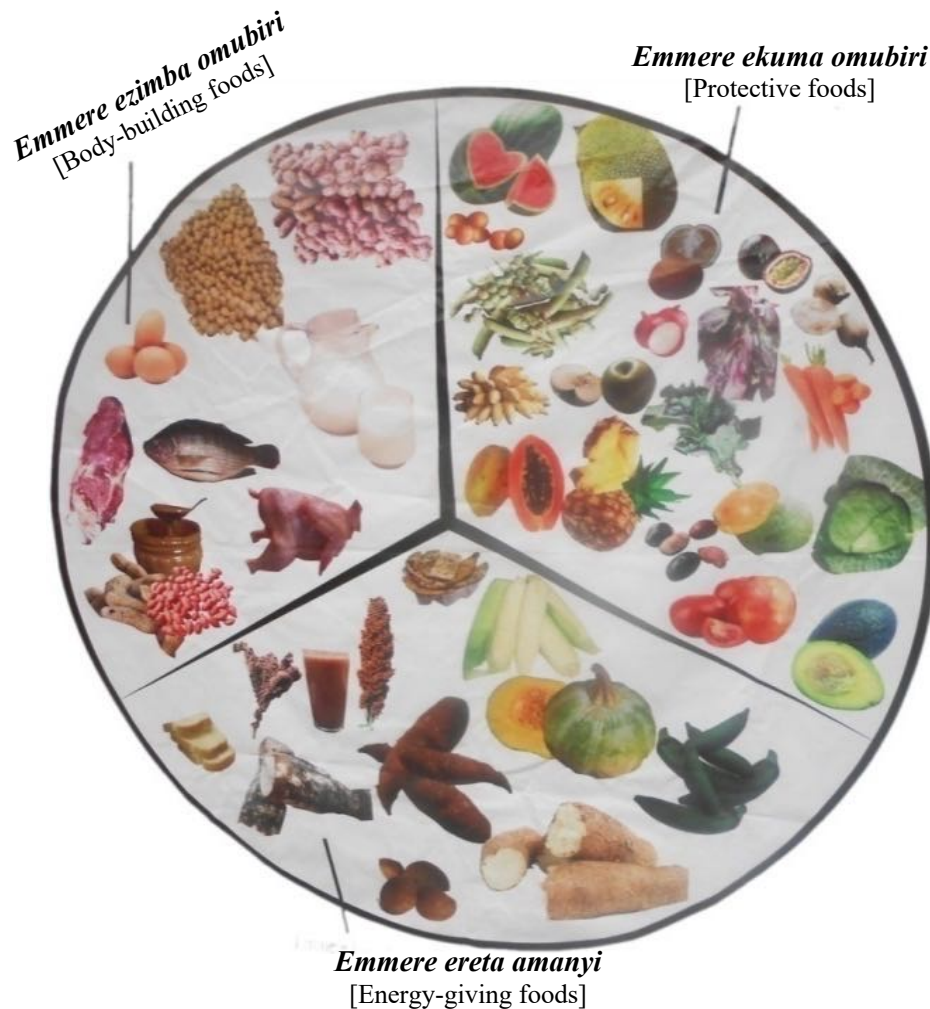
Figure 2: A food guide graphic used during training of primary caregivers in the