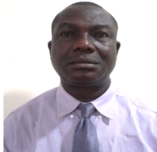
Adepoju Oladejo Thomas

Adepoju OT 1* , Dudulewa BI 1 and AY Bamigboye 2