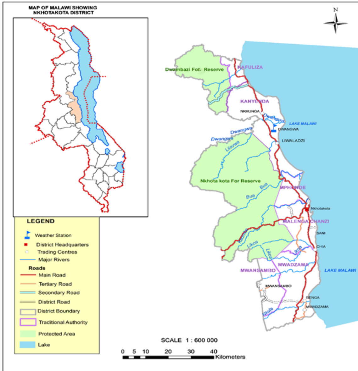
Figure 1: Map of Malawi showing Nkhota-kota district and the study area