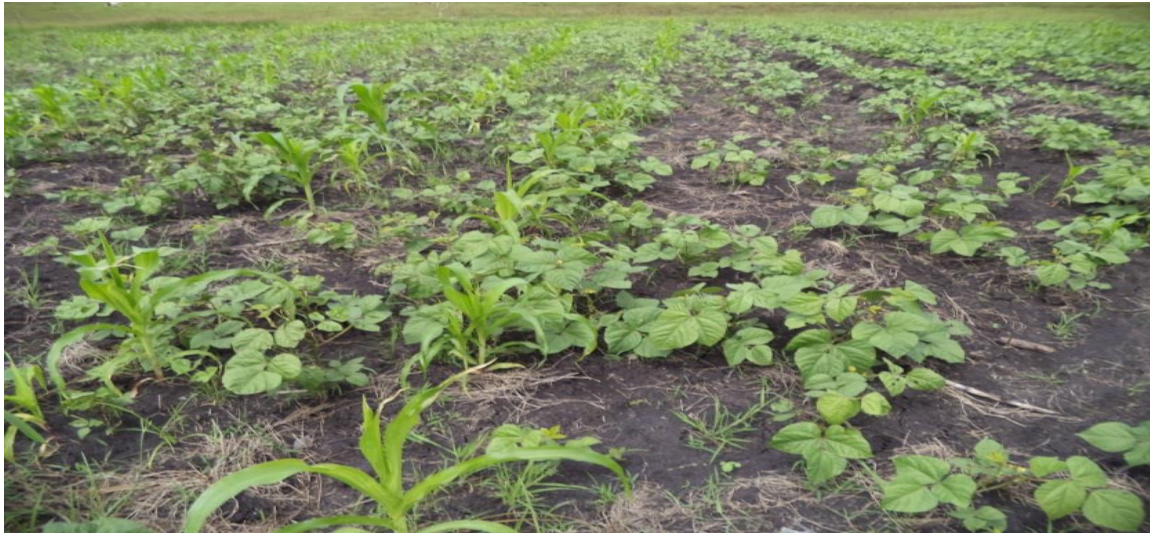
Figure 3: Green grams showing farmers' practice