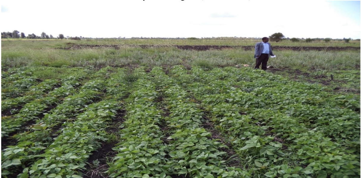
Figure 4: Well managed green gram field (Notice poorer performance mid-left)

Table 4 shows the results of the on-farm demonstration plots obtained. The plant height for green grams (Kiamanyeki) was higher in the two intervention plots by 4.5 and 10.0 cm for treatments 2 and 3 and yields were higher, that is 123% and 82%, respectively. There was, however, no difference in days-to-flowering in the three treatments. At Ngothi, although the tomato plant heights were lower for the intervention plots, the plants under treatment 3 flowered later and yielded higher (38 and 76%).