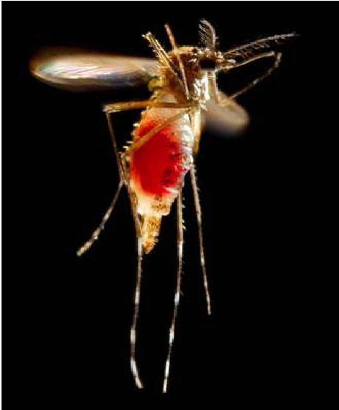
Figure 2. Hematophagy – the evolutionary brilliance of female mosquitoes to feed on the rich nutrient source of human blood is a critical link in the chain of events leading to the scourge of malaria. No link within the complex change of events has proven to be sufficiently weak to prevent infection – besides killing the mosquito by means of potentially dangerous chemical pesticides.