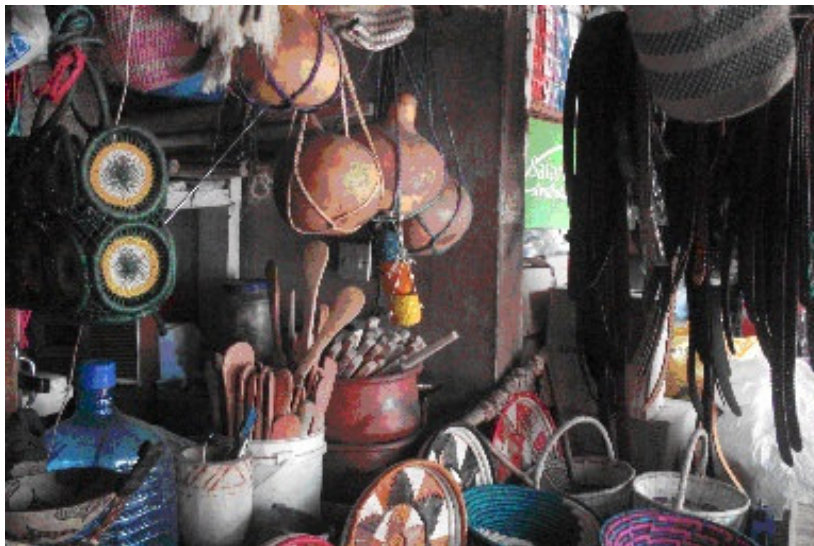
Figure 2. Some of the products made by women groups in Kisumu.

Some of the products they made are shown in Figure 1 . Figure 1 shows the baskets made by the Tonney Red women group. The group utilizes locally sourced plant materials to make products such as baskets, mats and bags. The products are made in various shapes and sizes according to the intended functions. These baskets are made of sisal and polythene papers; the use of polythene papers for making baskets such as these serves an important environmental conservation function, since many of these papers would have littered the landscape and blocked drainage systems; for example many of the products shown in this figure are sold to the locals as well as tourists. Some of these products are also sold to neighbouring towns such as Kisii, Migori, Homa Bay, Kericho and even to distant ones like Nakuru, Nairobi and Mombasa.