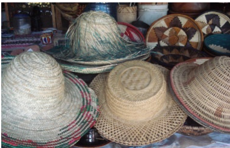
Figure 4. Hats made from water hyacinth plants.