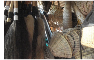
Lampshades and Flywhisks