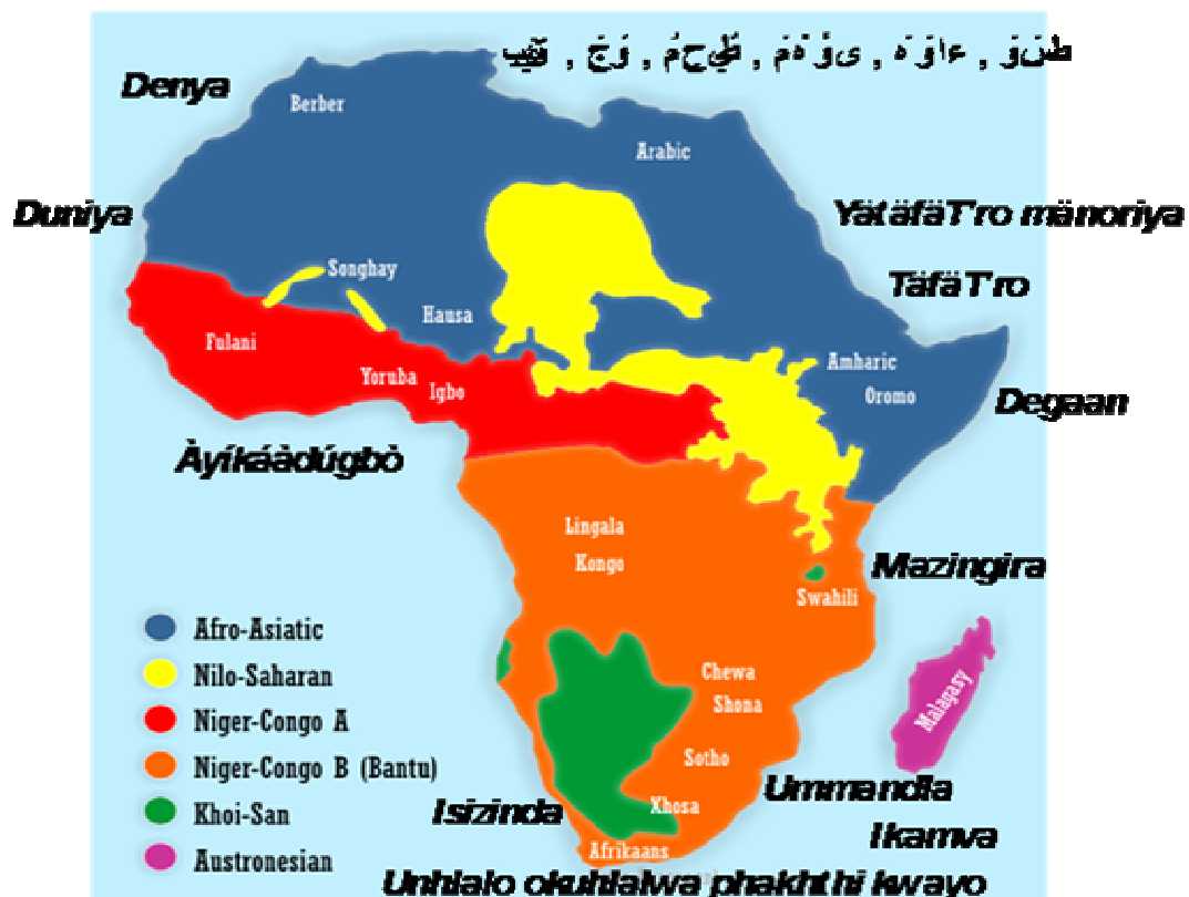
Figure 1. Map of African language families and local words used in reference to general understanding of “environment”.The distribution of language families follows the classification scheme of Joseph H. Greenberg 2 .