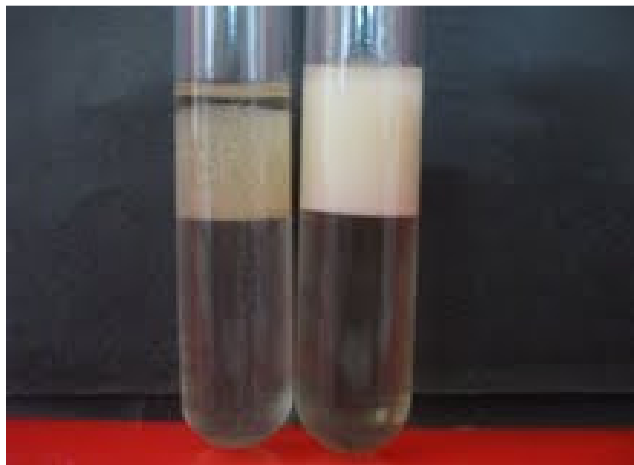
Figure 1. Emulsification activity assay test (a) Pseudomonas sp (MW2).