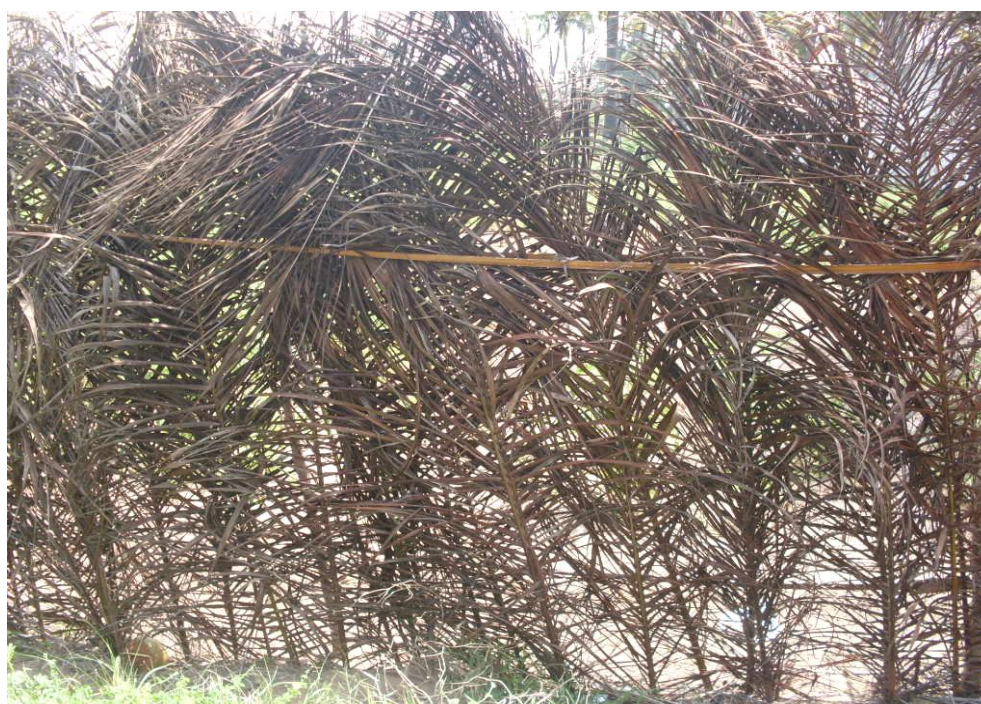
Figure 3. Palisade fence set up against tidal breeze.

0 = don't know; 1 = bad; 2 = average; 3 = good; 4 = very good.