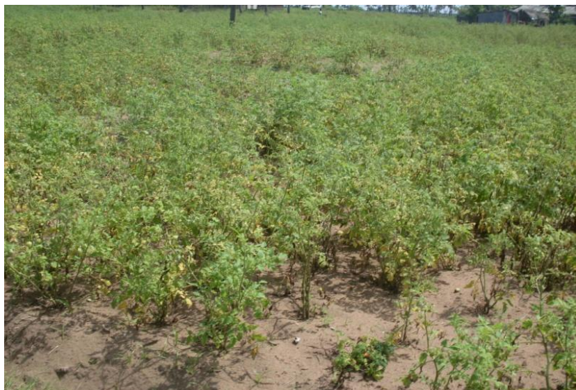
Figure 1. Overview of growing tomato in a farmer's field.