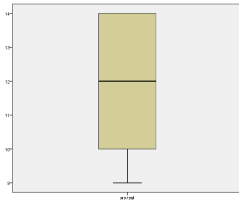
Table 1 compares the pre-test and post-test results of the mathematics education students sampled. The results showed an improvement in students' understanding of teaching and learning geometry. The minimum score students obtained in the pre-test was 9, while the maximum score was 14 out of 20.

teaching and learning geometry since the course was on the premises that, the students already had exposure to geometry.