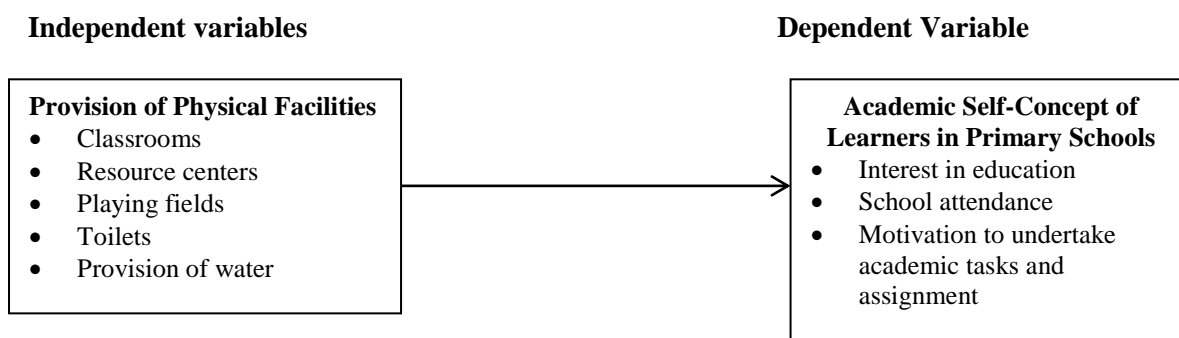
Figure 1 Conceptual Framework

In this study, the academic self-concept of students living in informal settlements served as the dependent variable, while the Provision of Physical Facilities, served as the independent variable. As can be seen in Figure 1 below, the intervening factors consisted of staff attitude, head teachers' management styles, and stakeholders' support.