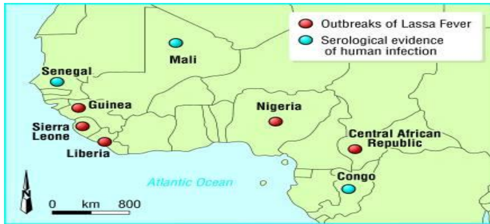
Fig 4: Regions and areas with major outbreaks of Lassa fever (33)

The number of LASV infections per year in West Africa is estimated at 100,000 to 300,000, with approximately 5,000 deaths. Unfortunately, such estimates are crude, because surveillance for cases of the disease is not uniformly performed. In some areas of Sierra Leone and Liberia, it is known that 10%-16% of people admitted to hospitals every year have Lassa fever, which indicates the serious impact of the disease on the population of this region (32).