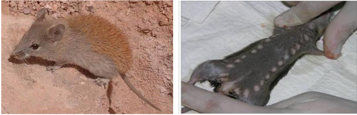
Fig 2: Pictures of the multimammate rat Mastomys natalensis