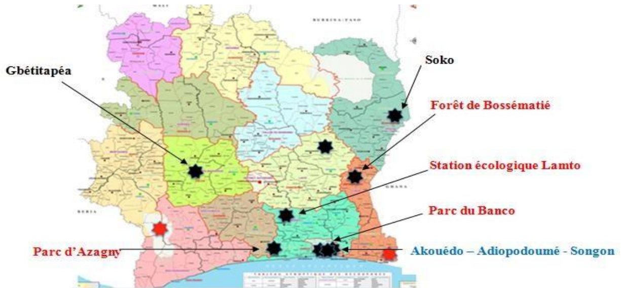
Fig 1: Study sites investigated for rodent reservoirs of emerging pathogens in Cote d'Ivoire (The black stars are the different sites, the sites written in blue are peri-urban, in black are peri-rural areas and in red are protected areas)