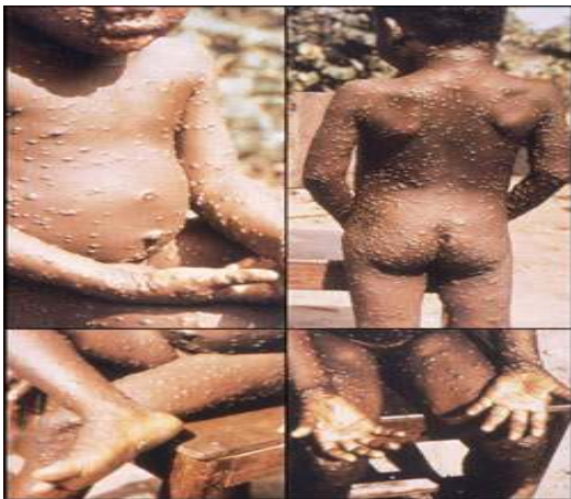
Figure 1: A child affected by monkeypox, showing generalized vesiculo-pustular rashes involving the trunk, limbs, face and limbs, extending to the palms and soles of the feet.

and generally less severe disease (4,16). Conditions which suppress cell-mediated immunity such as HIV may alter the natural history of the disease and may result in more severe infections (15). The lesions seen in them are also noticed to have regional monomorphism and a centrifugal distribution. Lesions in children may appear as nonspecific 1-5 mm erythematous papules, resembling an arthropod bite reaction. Mortality rates range from 1 to 10% with most cases occurring in children and in unvaccinated persons (16). Indirect or low-level exposure may result in asymptomatic or subclinical infections especially in persons living in or beside forests. Complications of monkeypox infection include pitted scars, deforming scars, secondary bacterial infection, keratitis, corneal ulceration, blindness, bronchopneumonia, septicaemia and encephalitis (3,5,17).