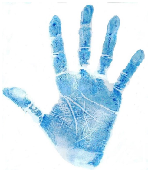
Fig. 5 Lines A, B, C, D arranged in letter 'M'