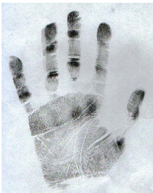
Fig. 4 Lines A, B, C, D with cascades