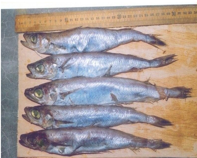
Figure 3: Frozen Hake as displayed in the Market