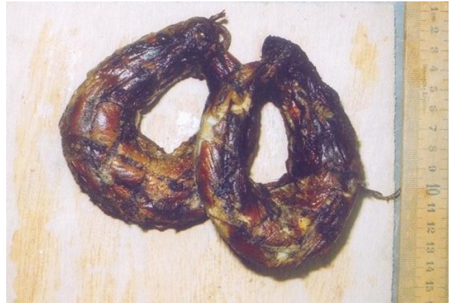
Figure 4: Smoked Hake as displayed in the Market