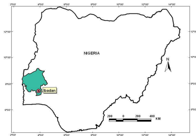
Plate 1: Map of Nigeria Showing Location of Ibadan in Oyo State

The experimental site for this study is the Department of Aquaculture and Fisheries Management, University of Ibadan, Nigeria in West Africa. The experimental site is located at Ibadan City, Oyo State, Nigeria. Ibadan is located in Southwestern region of Nigeria, on coordinates 7.401962 and 3.917313. Aquaculture in Nigeria started from Southwestern Nigeria specifically in Oyo State, and the region is still one of the main hubs of aquaculture in Nigeria. Map of Nigeria showing the location of Ibadan inside Oyo State is presented (Plate 1).