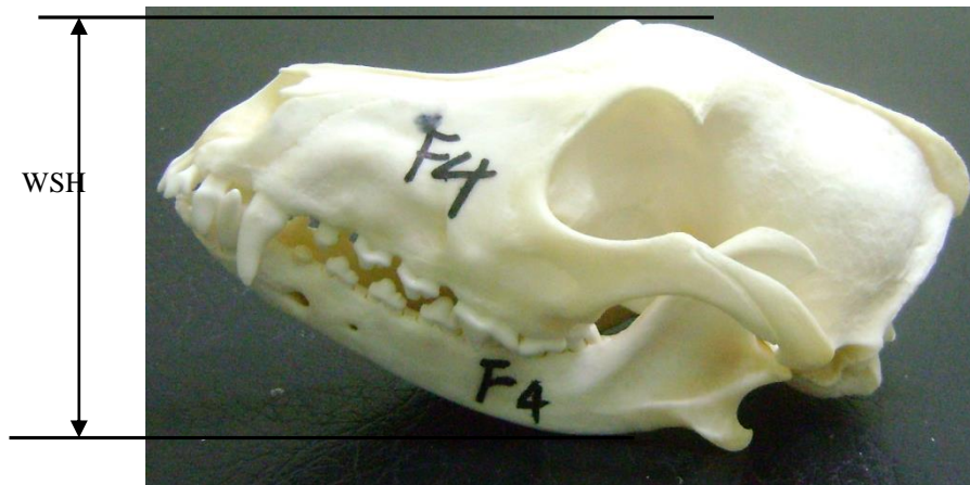
Plate 1: Lateral view of the skull of the NLD, showing the Whole Skull Height (WSH).