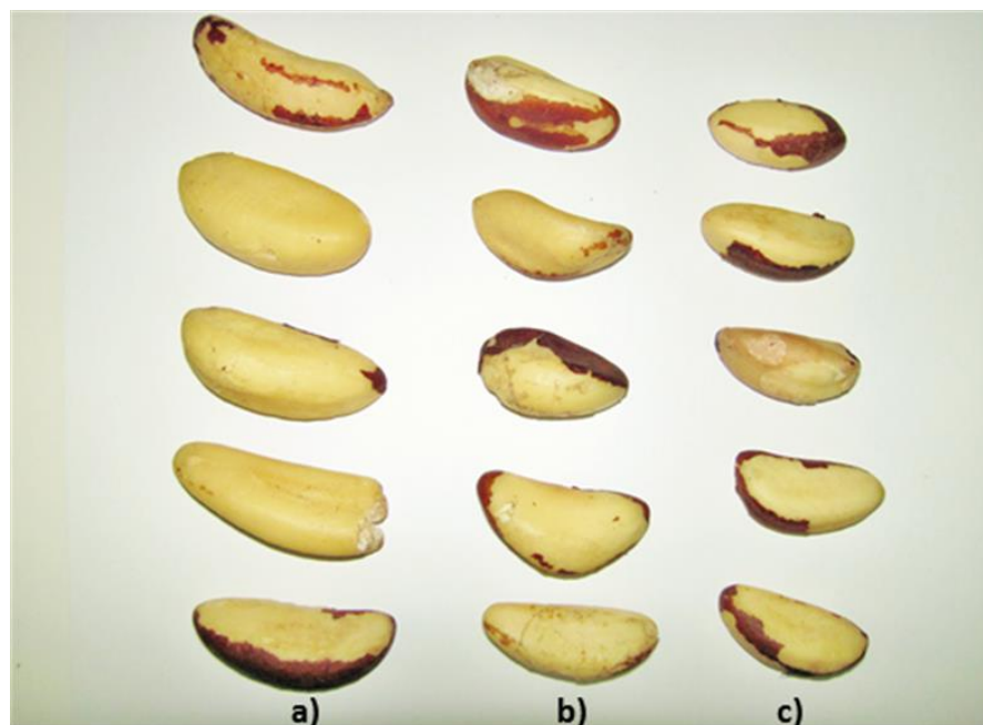
Figure 2. Different classifications of Brazil nut used by the processing industry: (a) large, (b) medium and (c) midget.