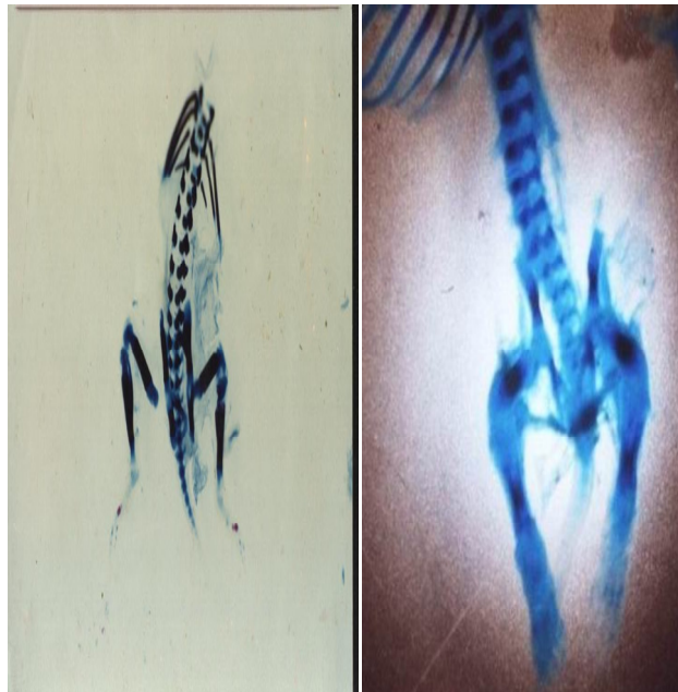
Figure 3. Hind limbs and vertebral column of control fetus at the 20th day of gestation (left) versus hind limbs and vertebral column of fetus maternally exposed to EMF from 1st to 20th day of gestation, showing sever lack of ossification.

that depend on the frequency. At mobile phone frequencies the RF energy is absorbed to a depth in tissue of about one centimeter. RF energy absorbed by