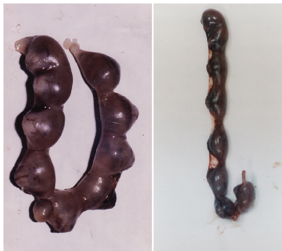
Figure 1. Uterus of control pregnant rats at 20 th day of gestation (left) vs. uterus of pregnant rats exposed to EMF from 7 th to 16 th day of gestation.