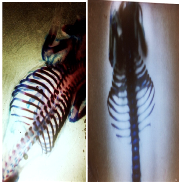
Figure 2. Skeletal system of the control fetuses (left) versus skeletal system of fetus maternally exposed to EMF from 1st to 20th day of gestation showing absent of 13th rib and shortens of 12th & 11th ribs.