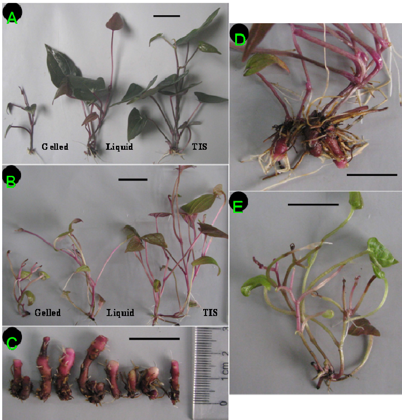
Figure 2. (A) D. fordii plantlets produced in gelled, liquid and TIS proliferation medium after six weeks of culture. (B) D. alata plantlets produced in gelled, liquid and TIS proliferation medium after six weeks of culture. (C) Various sizes of microtubers of D. fordii produced in TIS. (D) D. fordii plantlet with three microtubers produced in TIS. (E) The vitrified plantlet of D. alata cultured in liquid medium. Bar = 2 cm.

those in liquid medium (306.8 and 28.2 mg, respectively) (Table 1). The positive effects of the TIS on shoot growth had been demonstrated by many authors in earlier studies (Alvard et al., 1993; Lorenzo et al., 1998; Etienne and Berthouly, 2002; Escalona et al., 2003; Yan et al., 2010). Under the same growth conditions, compared to