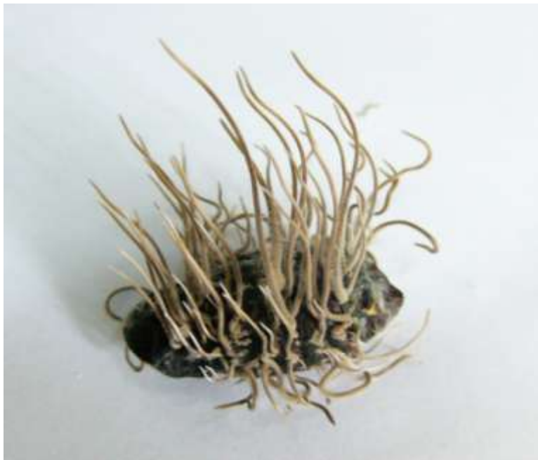
Figure 3. The original sample collected in Baekdu Mountain, China.