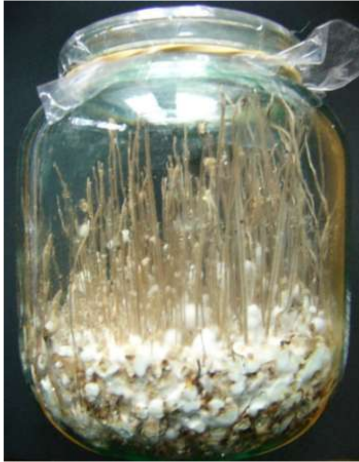
Figure 2. The matured fruiting bodies after artificial cultivation for 45 days.