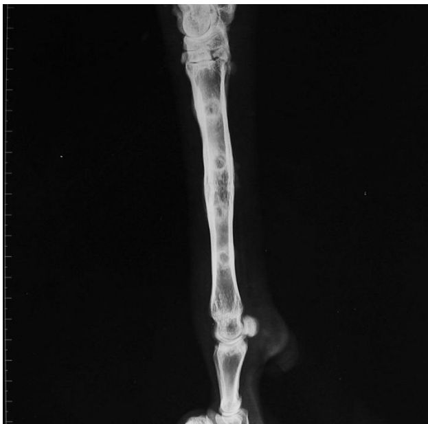
Figure 7. X-ray image of the leg eight weeks after the operation.

was far less than the required value (1 mm). This indicates the correctness of the design.