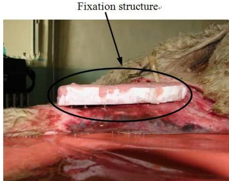
Figure 3. The image of the fixed leg of the sheep.

According to mechanics theory, if one nail on one side is used, the device can be instable; as such, this must be avoided. On the other hand, because the diameter of the sheep's shinbone is just 50 mm, 8 nails are not so necessary. At the same time, because 2 mm is too slim, it is hard to fabricate in bulk. When the diameter is 3 mm, the load close to the ultimate result must also be neglected. So, the fitted combination of the diameter and the number can be (4 mm, 4), (4 mm, 6), (5 mm, 4), (5 mm, 6), (6 mm, 4) and (4 mm, 6). So, according to rule one, (4 mm, 4) can be selected as the best scheme.