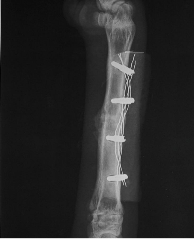
Figure 6. X-ray image of the leg four weeks after the operation.