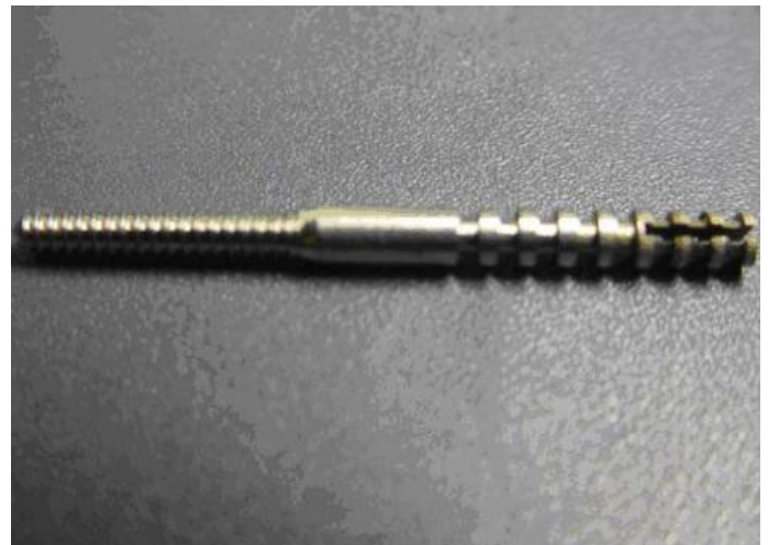
Figure 2. The stainless steel nail used.

Simple working principle of the fixation is shown in Figure 1. It is mainly composed of the stainless steel nails, the macromolecule supporting structure (polymethyl methacrylate, PMMA) and the broken bone. During the course of the operation, the stainless nails are first installed on the broken bone, before they are fixed by the macromolecule material using the so called quick casting method. So, the broken bone and stainless nail are connected as a whole body by the material. The macromolecule material is used because of its advantages of low concreting temperature and high concreting speed. Additional injuries, except the operations such as the scald (caused by high temperature), split of the bone (caused by the inner stress during the course of the fastening process), etc., are reduced correspondingly. In order to avoid the relative movement (including the rotating and moving) between the nail and macromolecule material, the nail (Figure 2) is produced with a rectangle groove on top of it. Fabricating this device with this method can not only reduce the bulk and weight as compared to the conventional external device, but can also avoid the second-time operation caused by the conventional inner fixation structure. The injury caused by the pre-introduced methods is also decreased. On the other hand, because the structure was cast on the surface of the patient's skin, the possibility of the infection caused by exposure