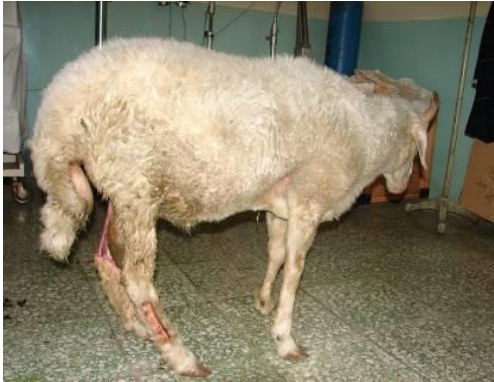
Figure 4. The walking picture as soon as the sheep woke up.

sheep during the course of the operation. It was concluded from the sketch that the reposition was very good and no abnormality took place, which indicated that the reliability for this device was perfect. When the sheep woke up, it could stand and walk immediately, which indicated little damnification in the results of the operation. Figure 4 shows the operated sketch of the sheep. Comparing this to the conventional external fixation device, the dimension of the device was greatly reduced. Figure 5 shows the X-ray image of the operated broken leg two weeks after the operation. In this sketch, some bony callus was developed around the broken position. Consequently, no obvious relative movement could be observed between the broken ends of the bone, which indicated that the operation was successful. Four weeks later, bony callus (Figure 6) developed on the wound and obvious remodeling was formed. The fracture line was dim and the position was excellent. Figure 7 shows the X-ray image 8 weeks after the operation. It was concluded from the sketch that the fracture line disappeared, which indicated that the bone healed up and the structure can be taken away now. This process indicates that this is a feasible scheme to cure the broken bone.