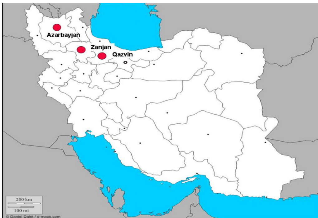
Figure 1. The major bean growing locations in Northwest Iran (green parts), including Qazvin, Zanjan and East Azarbyjan provinces, where infected bean samples were collected.

the disease. Researchers believe that irrigation, soil factors and plant residues affect the main severity of decline disease in bean plants (Horsley et al., 2000; Iglesias et al., 2000; Ogg et al., 2000; Kuruppu et al., 2004). Fusarium wilting attacks bean plants which have been subjected to environmental stresses. Severe infections can lead to plant death and crop losses, because the taproot is damaged causing proliferation of a shallow fibrous root system that can only provide inadequate water uptake in dry soils (Bruton and Miller, 1997; Jensen et al., 2004). However, severity of bean root rot disease involves cropping history, plant spacing, soil moisture, temperature stresses and soil compactness (Buruchara and Camacho, 2000; Lozovaya et al., 2004; Nunez et al., 2005).