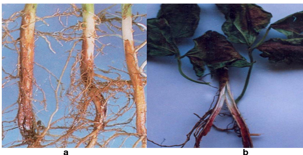
Figure 2. Root rot (a) and vascular reddish-brown lesions (b) on infected bean caused by Fusarium species grown in Zanjan province.

a Infected percentage for each species was calculated based on (total isolated species) /300 X100.