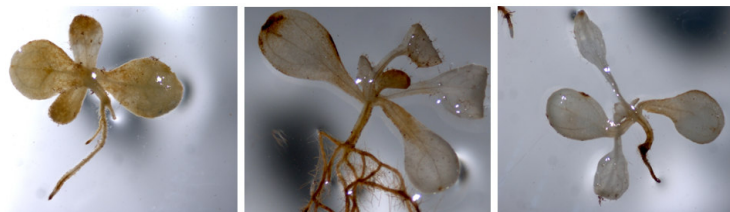
Figure 2. AtVDAC2 transgenic Arabidopsis stained with DAB under NaCl treatment. Left, over-expressing line; middle, wild type (RLD); right, inhibited-expressing line.

root length was measured. Robust seedlings were picked to the MS + NaCl plates after grown on MS plates for 3 days. Two weeks later, their root length was not same. Over-expressing lines were more sensitive to NaCl than the inhibited lines and wild type, as the root length of the over-expressing lines were shorter. The inhibited lines were less sensitive, as their root length was longer than the others (Figure 1B). This result showed that AtVDAC2 was involved in the NaCl stress response pathway.