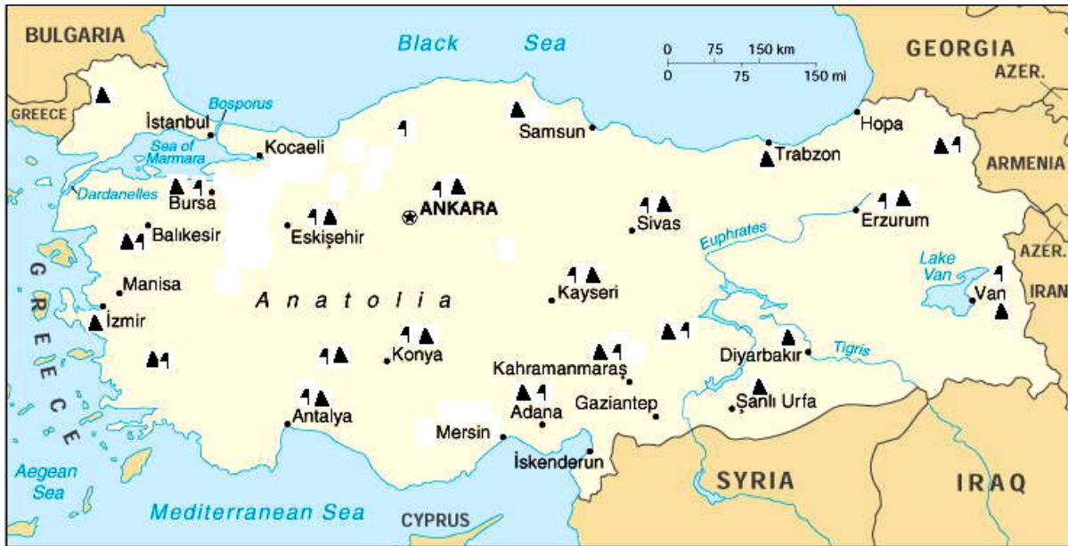
Figure 1. Map of Turkey showing locations of SHW (flag) and WUAs (triangle)-operated irrigation schemes.

a great role on temperature changes. Therefore, the south region is under the influence of sub-tropical climate which is similar to Mediterranean climate. On the other hand, in the north region of Turkey the Black Sea climate which is always rainy in all seasons is observed (Anonymous, 2009). In general, summer is warm and dry, whereas winter is cold and rainy. The average annual precipitation, total precipitation, total runoff, and total usable potential are 643 mm, 501, 186, and 112 km 3 , respectively (Degirmenci et al., 2008). A variety of crops are grown in the study area, but common crops are wheat, sugar beet, corn, fruit, vegetable, cotton, tobacco, rice and olive.