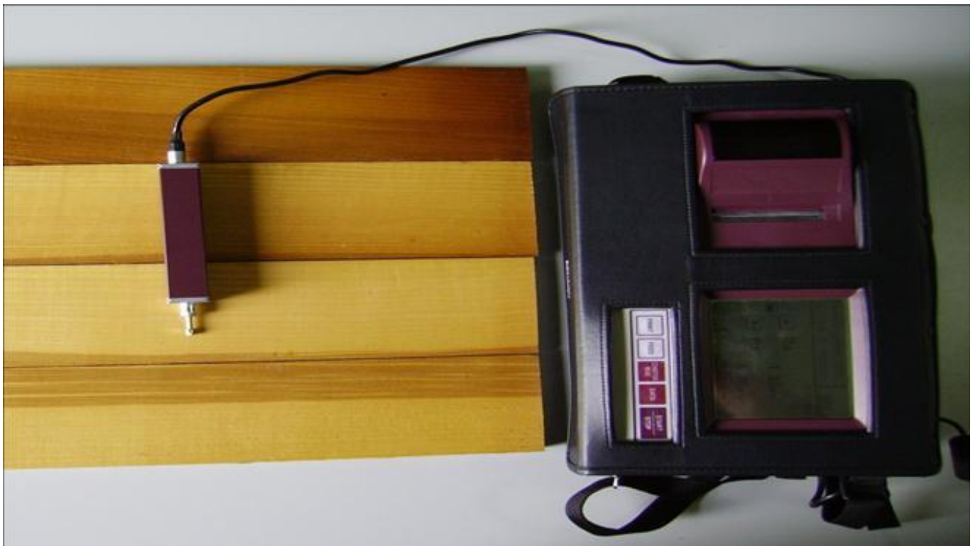
Figure 3. Mitutoyo SurfTest SJ-301.