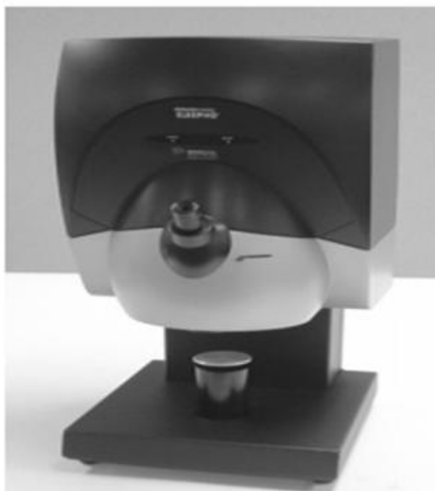
Figure 1. Elrepho-spectrophotometer.