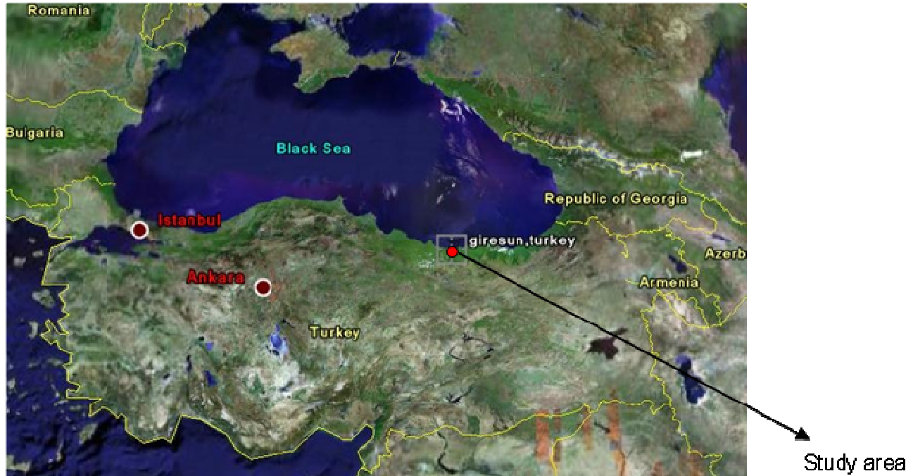
Figure 1. The location of research area in Giresun Forest Enterprise Region.

Ratio of HR_w to HR_r was obtained using the formula (Diament et al., 1968):