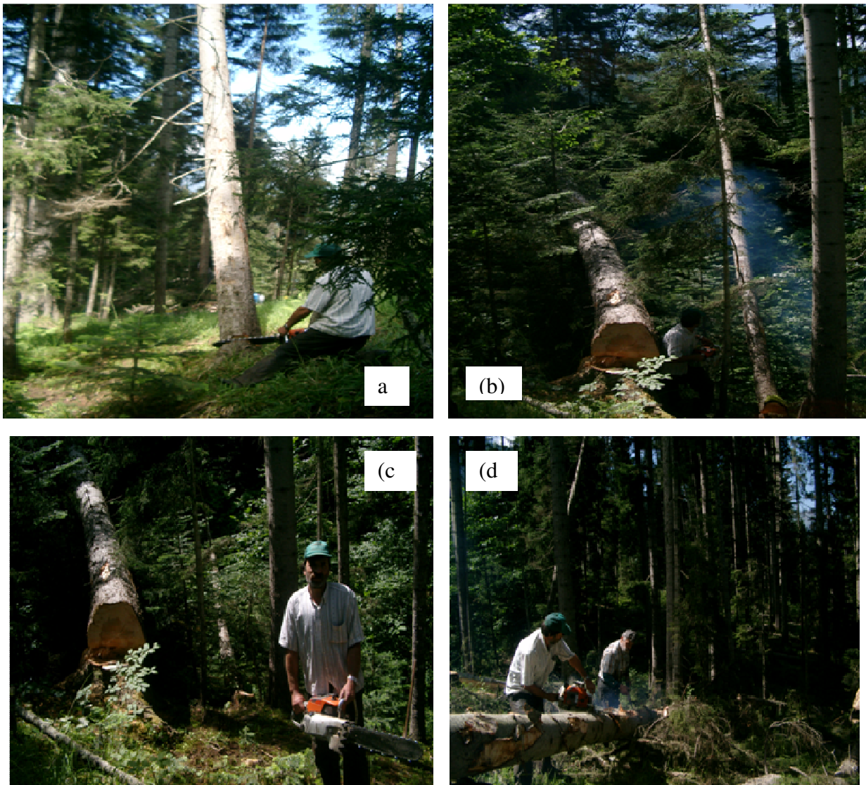
Figure 4. The Chainsaw Operator; a: cutting, b: falling, c: walking and d: branch cleaning.