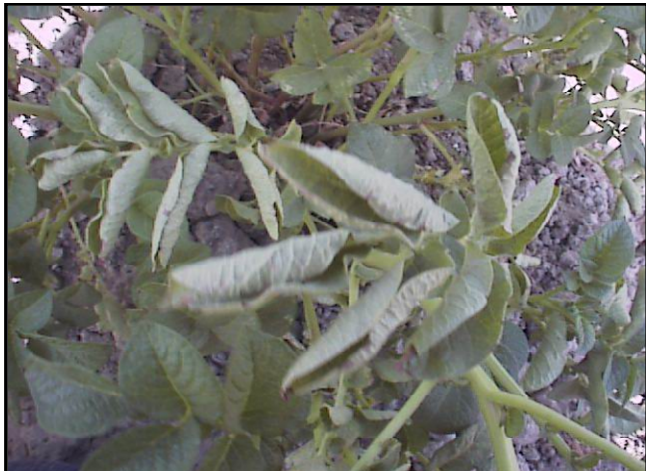
Figure 1. Upwardly rolled and erect leaves caused by PLRV in potato field.