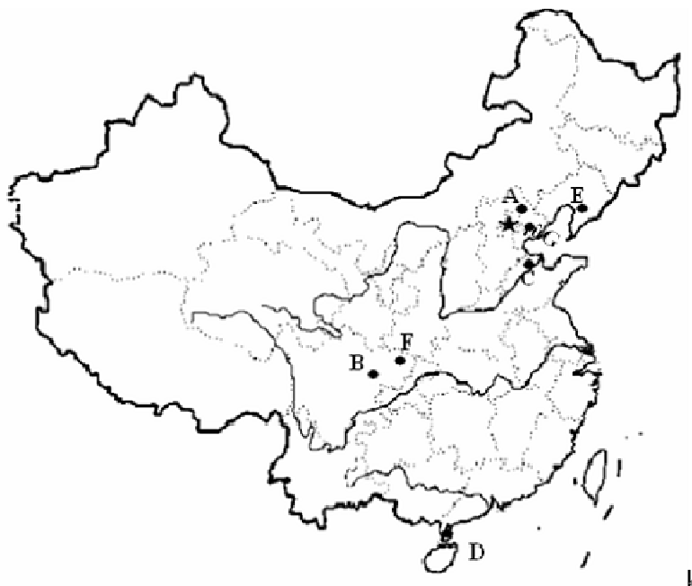
Figure 1. Geographical distribution of the nine goat populations in China. A= Chengde Polled goat; B = Chengdu Ma goat; C = Jining Gray goat; D = Leizhou Black goat; E = Liaoning cashmere goat; F = Nanjiang Brown goat including 3 strains ; G = Tangshan dairy goat.