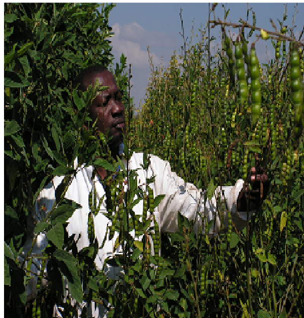
Figure 5. High yield potential in newly developed elite pigeonpea germplasm adapted to high latitude areas in southern Africa.

In this study, elite germplasm adapted to the high latitude areas was developed successfully. However, it is difficult to conclude unequivocally that the new germplasm is insensitive to photoperiod per se . Wallis et al. (1981) concluded that selection for early flowering at high latitudes (27° to 29°) did not necessarily identify material insensitive to day length. Since photoperiod is quantitatively inherited, a firm conclusion would also require a clear threshold which forms the basis for classifying insensitive versus sensitive material. Furthermore, the