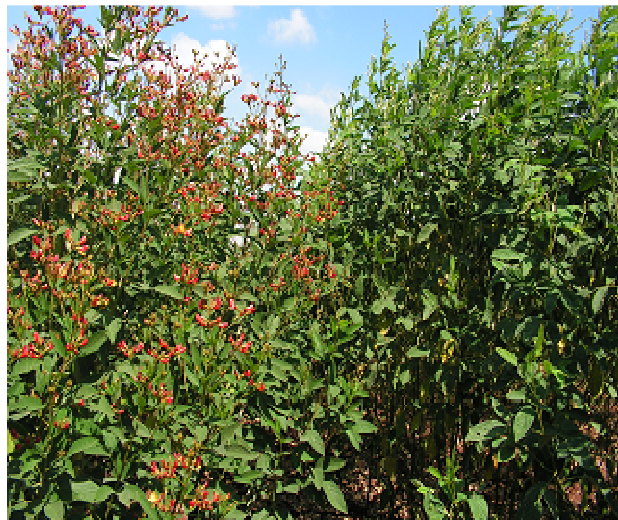
Figure 4. Early flowering (left) in newly developed pigeonpea germplasm adapted to high latitude areas in southern Africa compared with late flowering in a traditional variety.

color of all the elite germplasm was white which is preferred in the market. The highest grain yield (3.0 t/ha) was observed for the cultivar ICEAP 01480/32 compared with 1.0 t/ha attained by Royes (Table 1). Similarly, cultivar ICEAP 01514/15 obtained 2.9 t/ha. Although higher grain yields (>4.0 t/ha) of hybrid pigeonpea have been reported elsewhere (Saxena and Kumar, 2006), it remains unclear whether such technologies can outperform this newly developed germplasm in the high latitude areas in southern Africa. Probably, this enhanced germplasm could be useful in future genetic improvement activities aimed at development of hybrid pigeonpea technologies for southern Africa.