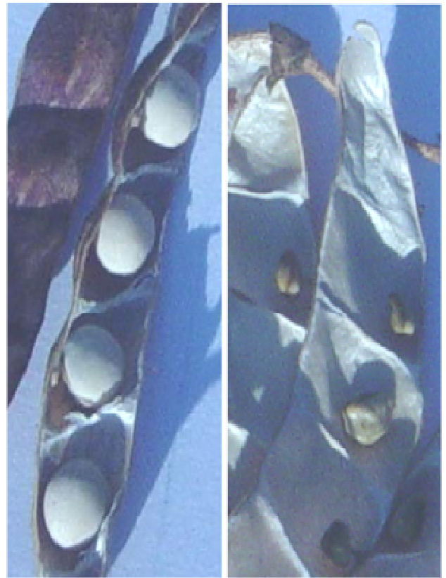
Figure 3. Normal, plumb (left) versus abnormal, shrivelled (right) pigeonpea seed.

than both the commercial cultivar Royes (173 d) and the landrace Mtawajuni (172 d). On average, the time to flowering and maturity among the new germplasm was reduced by 10 d in comparison with that for the unimproved landrace. However, there was a weak correlation ( R^2=0.45 ) between 50%DF and 75%DM suggesting that early flowering genotypes may still require a relative-