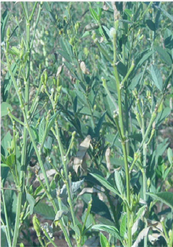
Figure 2. Flower abortion and poor pod development in pigeonpea.