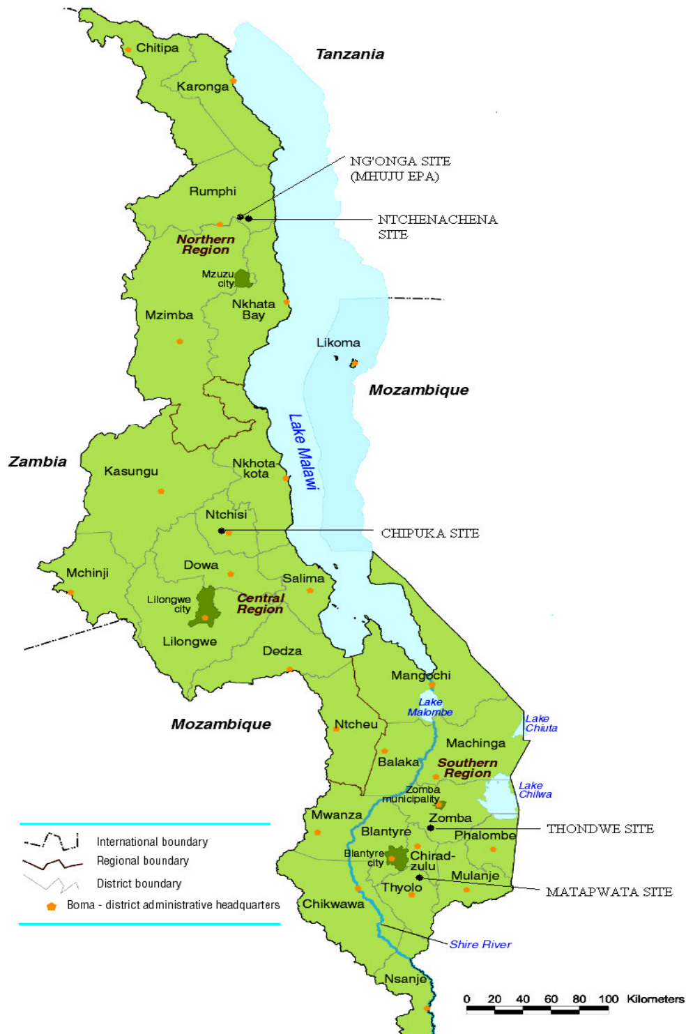
Figure 1. Map of Malawi showing sites of beans trials.

headed households and one male headed household carried out the trials in Thondwe. In Ntchenachena, the trials were conducted by two male headed households and three female headed households. Following the selection process, farmer training was conducted in all the sites where the trials were located. The training covered management practices of the trials, expected outputs and