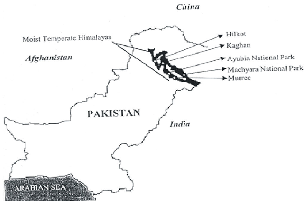
Figure 1. Study area.