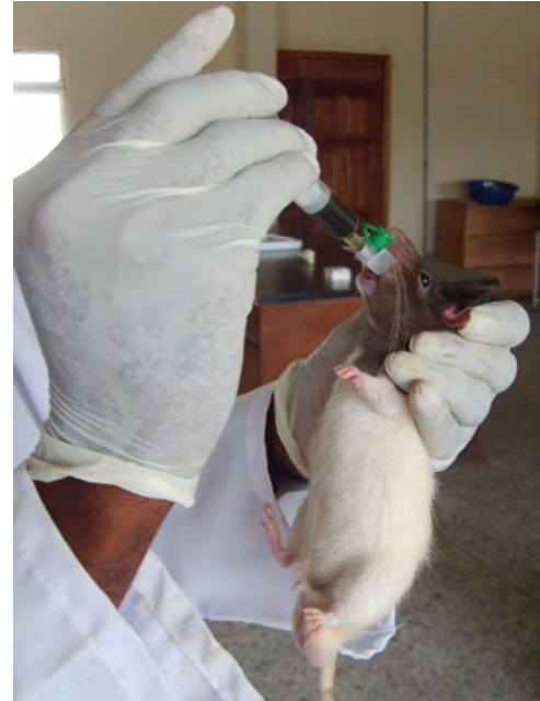
Figure 13. Injecting the test solution into the oesophagus of the rat by pushing down the plunger of the syringe.

The none ready availability of the standard oral cannula designed for the varieties of laboratory animals and a