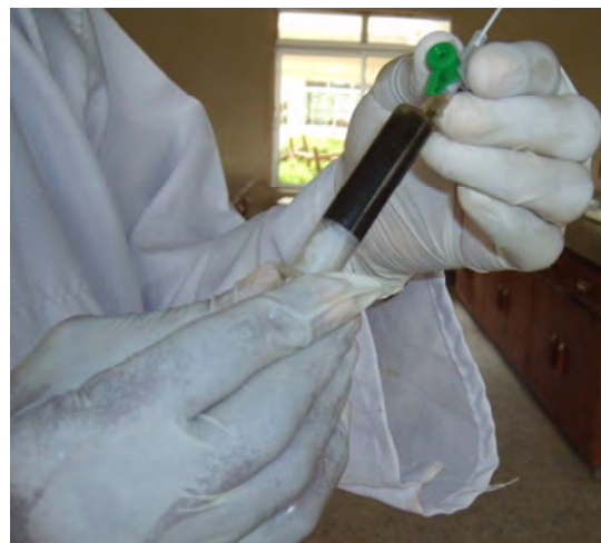
Figure 3. Connect the Mediflon intravenous cannula to the 10 ml syringe containing the test solution.