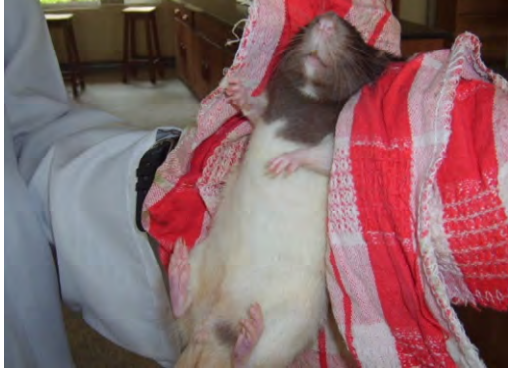
Figure 10. Restraining the rat by the scruff with a towel sandwiched between the hand and animal.