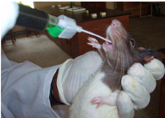
Figure 11. Inserting cannula tip by the left side of the rat's central canine. Rotating the tip in the oropharynx to overcome resistance.