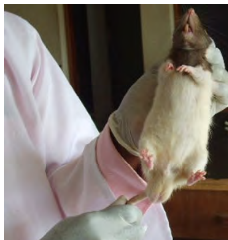
Figure 9. Rat picked up by the scruff and held with the esophagus kept as straight as possible.