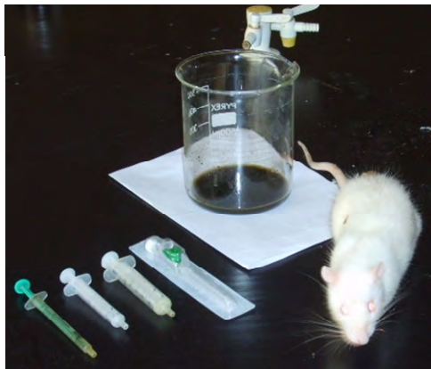
Figure 1. Materials required: Mediflon/Medicut intravenous cannula, plastic syringes (1, 2, 5 and 10 ml).

solution of drug or test substances, beaker and towel.