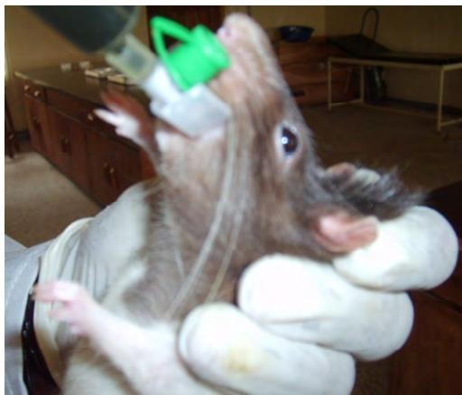
Figure 12. Entire length of cannula tube inserted with tip well lodged in the oesophagus.

pend largely on the route used to administer it (Wilkison, 2001).