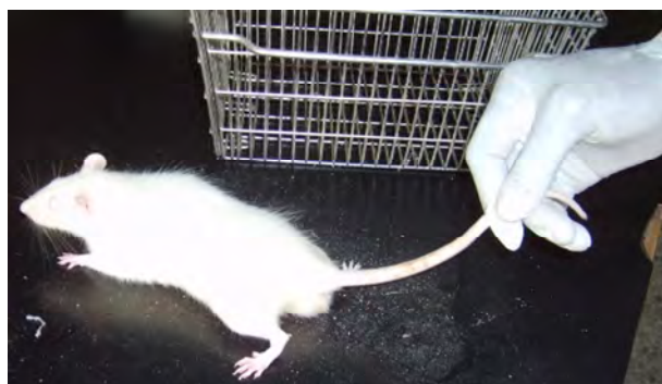
Figure 6. Rat placed on the flat surface of the laboratory bench.