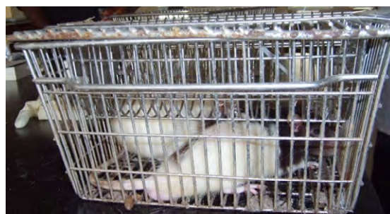
Figure 4. Rats in the cage.

soon stimulates a swallow reflex, which transmits the cannula into the esophagus. Occasionally the animal may use any of its strong hands to attempt to push the cannula out of the mouth at this stage or during the injection. Working alone in this situation, instead of focusing on restraining the tail as explained above it greatly helps to use any of the other free fingers of your left hand to hold down the