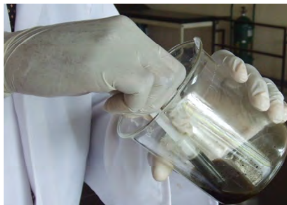
Figure 2. Aspirating the extract from the flask with a 10 ml syringe.

The cannula is inserted into a desired syringe containing the solution of drug or fluid test substance and held with the right (dominant) hand. It is introduced into the animal's oral cavity with the plastic tube tilted to the left side of the animal's incisor teeth in the midline and maintained in this position throughout the procedure to avoid damage to it from the animal's bite. The tube is now carefully advanced down the oral cavity between the tongue and roof of the mouth, occasionally it passes easily straight on into the esophagus at other times a resistance is encountered. This resistance can be relieved by the maintenance of a gentle inward push on the cannula while rotating the tip from side to side. This