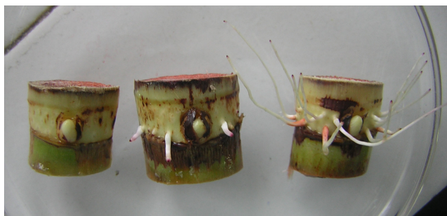
Figure 1. Different types of germinated buds of sugarcane in in vitro conditions.

Means in the same row followed by the same letters do not differ significantly ( p < 0.05 ).