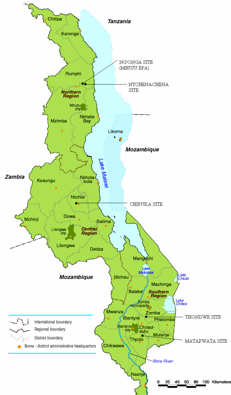
Figure 1. Map of Malawi showing sites of beans trials.

Through the middle of the field, a 1 m wide path was demarcated and all around the field was a path of measuring 0.5 m wide. Twenty-one rows each measuring 5m in length were marked on either side of the center path. The distances between the row centers and planting stations in a row were 0.75 m and 10 cm respectively. Farmers were advised to weed regularly but not apply fertilizers or chemicals to the entries.