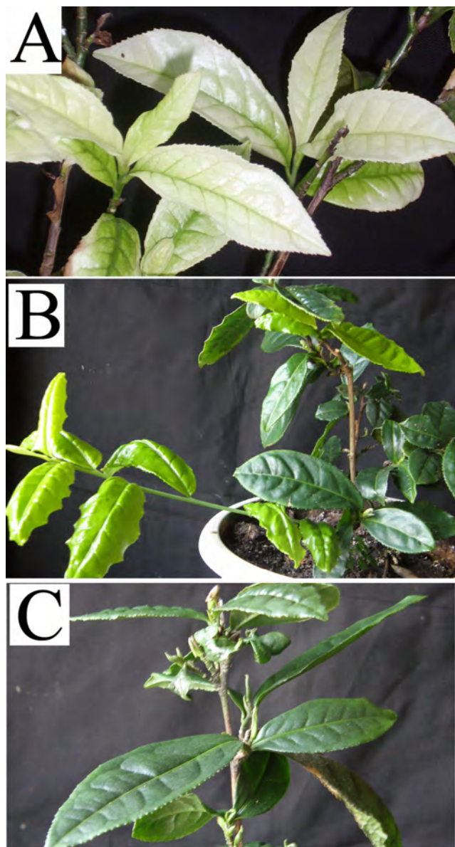
Figure 1. Leaf colour of two tea cultivars at different temperatures. A. 'Xiaoxueya' at 15°C; B. 'Xiaoxueya' at 20°C; C. 'Fudingdabai' at 15°C.

*a/b: The ratio of chlorophyll a to chlorophyll b