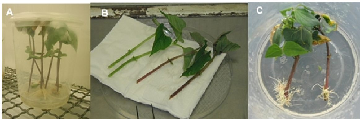
Figure 1. A: P. vulgaris (genotype Xan) one week after germination; B: derooted P. vulgaris (genotype Carioca left and Xan right) before Agrobacterium infection; C: hairy roots of P. vulgaris (genotype Xan) forming on the inoculated derooted seedlings (view from the top in large pot).